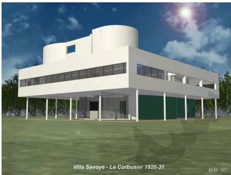
Villa Savoye - Le Corbusier 1928-31