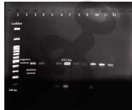
FIGURE 2: PCR product of PVL gene (agarose 1.5%). Lane Ladder: molecular size marker. Lane 3: positive control for PVL gene (433 bp). Lane 2: negative control. Lanes 4 and 6–12: positive isolate from patient For PVL gene.

Of the 116 S. aureus isolates from skin infection of pemphigus patients included in this study, 48 (41.3%) were MRSA (OR = 2.3, p = 0.006 ), 57.7% were MSSA (67/116), and 52.5% were MDR (OR = 1.8, p = 0.036 ). The prevalence rate of PVL-producing S. aureus infection in pemphigus patients was 21.5% (25/116) (Figure 2). Of these PVL positive S. aureus