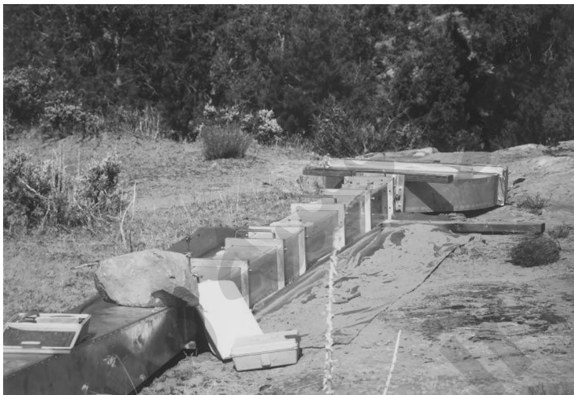
Figure 1. Portable wind tunnel, assembled in the field.

Comparisons across the three crustal classes were done using a two-way ANOVA and multiple range test. T -tests were used to distinguish between disturbance treatments and controls.